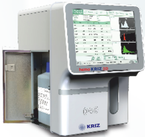
Hematology: hemo KRIZ Analyzers & Reagents