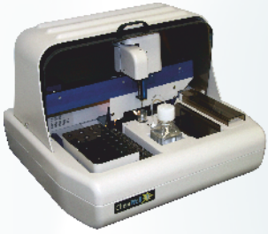
Clinical Chemistry: Analyzers