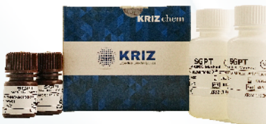
Reagents: KRIZ chem, Clinical Chemistry Reagents